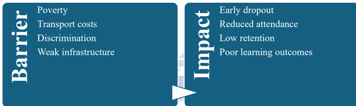
Table 2 Educational Barriers

discriminatory attitudes, limited scholarship opportunities, and early participation in labour markets due to economic necessity. According to UNESCO, educational exclusion among marginalized populations contributes directly to long-term poverty, reduced civic participation, and intergenerational inequality (UNESCO, Global Education Monitoring Report , 2022). Human rights reports further indicate that discriminatory social attitudes and institutional neglect frequently reduce school retention rates among minority students (HRCP, 2023).