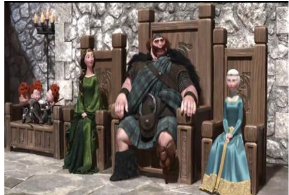
Table 7 below shows that male characters are invariably represented as active agents, decision makers, and possessors of institutional power, while female characters are passive, obedient, and

dependent. The table clearly shows that the different actions in the film, linguistic patterns, and the themes that they suggest strengthen gender stratification across the films.