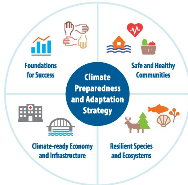
Figure 2: This diagram presents a climate adaptation strategy divided into four key areas: (1) Foundations for Success, (2) Safe and Healthy Communities, (3) Climate-ready Economy and Infrastructure, and (4) Resilient Species and Ecosystems. These pillars support a central goal—Climate Preparedness and Adaptation Strategy—aimed at enhancing resilience to climate impacts through integrated planning and action.

developing world are among the hardest hit by climate change, even though they have contributed the least to the conditions driving it (Rosa et al., 2023). The effects of climate change are exacerbated by social inequalities, preventing some people from accessing resources and decision-making. This also highlights the importance of climate justice mechanisms that ensure a just and equitable climate response (Malerba, 2022).